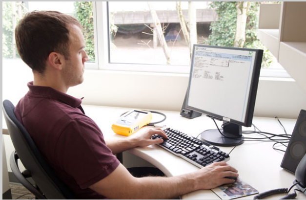
LinkWare Report with Encircled Flux and Test Reference Cords Tested